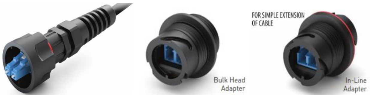
LC Duplex Plug

We also provide reels with 'embedded' connectors mounted in the centre of the reel, thus allowing daisy chaining of reels. We can customise reels to your specification, contact us to discuss.