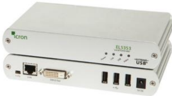
LEX (Local Extender) front view

The EL5353 KVM Extender System features the latest and most robust HD video and USB extension technology from Icron Technologies. The EL5353 extends both DVI and USB 2.0 applications up to 100m over a single CAT 5e/6/7 cable.