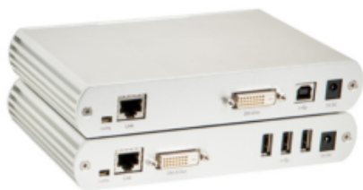
Rear views of LEX (top) and REX (bottom)